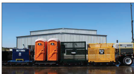
JOB SITE COMBO UNIT