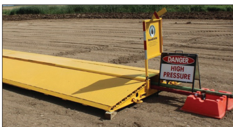
PIPE RAMP RENTAL