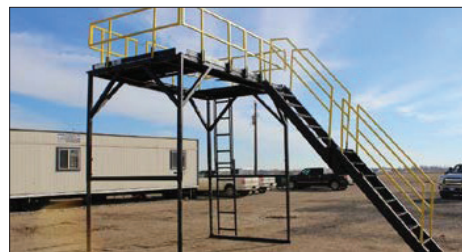
WELL HEAD FRAC STANDS