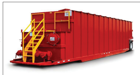
STEEL TANK INSPECTION SERVICES

Call the location near you or visit www.newkota.com .