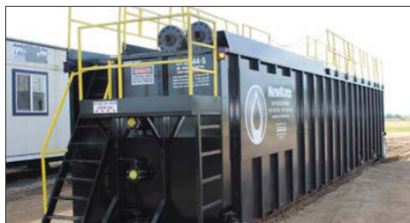
OPEN-TOP TANK RENTAL

Trust NewKota to save you time and money. We offer a growing range of 100% satisfaction-guaranteed oil field support services and equipment rental options – all designed to keep your operations running at peak performance. Rentals include equipment designed and patented by us to optimize the cost and performance operations of the oil field industry.