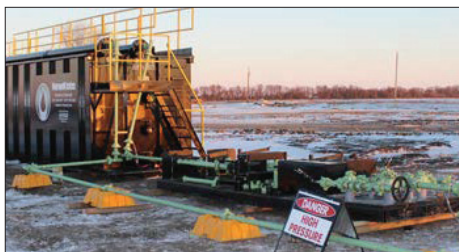
FRAC SCREEN-OUT SUPPORT