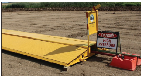
PIPE RAMP RENTAL