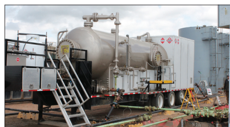
PRODUCTION TESTING FLOWBACK SERVICES